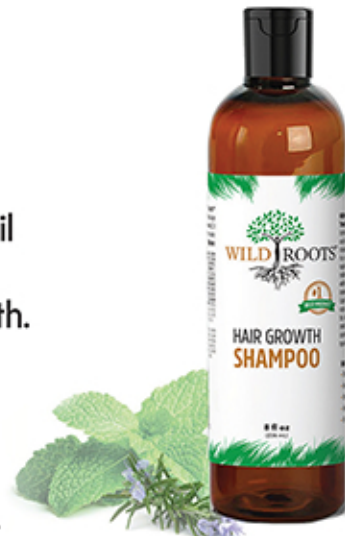
WR23186 SHAMPOO 8oz