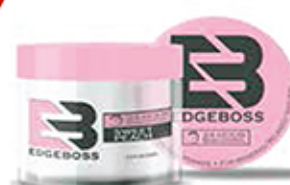
EB58808 SWEET PEACH