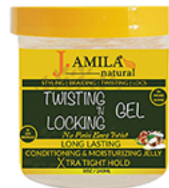
TL36267 TWISTING & LOCKING GEL XTRA TIGHT HOLD (8 OZ)