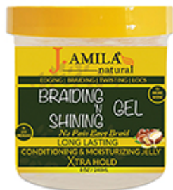
BS36266 BRAIDING N' SHINING GEL XTRA HOLD (8 OZ)