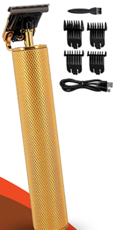
GOLD COLOR TRIMMER