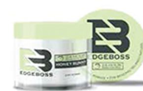
EB58810 HONEY BUNNY