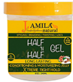
HH36268 HALF N' HALF GEL XTREME TIGHT HOLD (8 OZ)