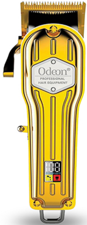
GOLD COLOR CLIPPER