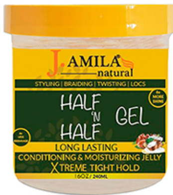
HH36265 HALF N' HALF GEL XTREME TIGHT HOLD (16 OZ)