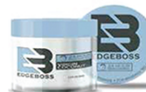
EB58805 VIRGIN COCONUT