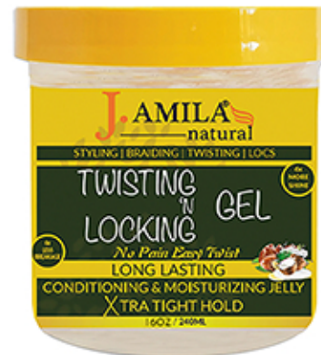
TL36264 TWISTING & LOCKING GEL XTRA TIGHT HOLD (16 OZ)