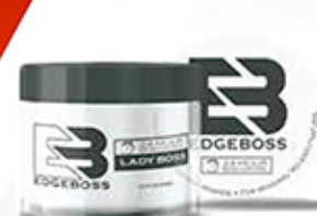
EB58800 LADY BOSS