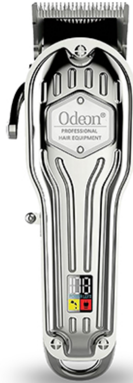
SILVER COLOR CLIPPER