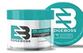
EB58806 CUCUMBER LIME