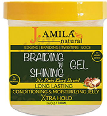
BS36263 BRAIDING N' SHINING GEL XTRA HOLD (16 OZ)

INFUSED WITH : ARGON OIL, CASTOR OIL, PURE HONEY, OMEGA 6, VITAMIN E, OLIVE OIL.