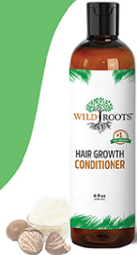
WR23187 CONDITIONER 8oz