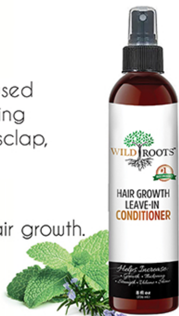
WR63173 Leave-in Conditioner

Vitamin E: Adds shine and manageability to hair.